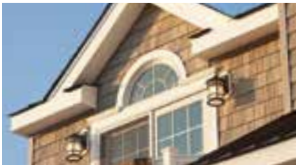
POLYMER SHAKES & SHINGLES

CertainTeed products are designed to work together and complement each other in color and style to give your home a beautiful finished look.