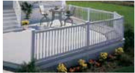
DECKING AND RAILING