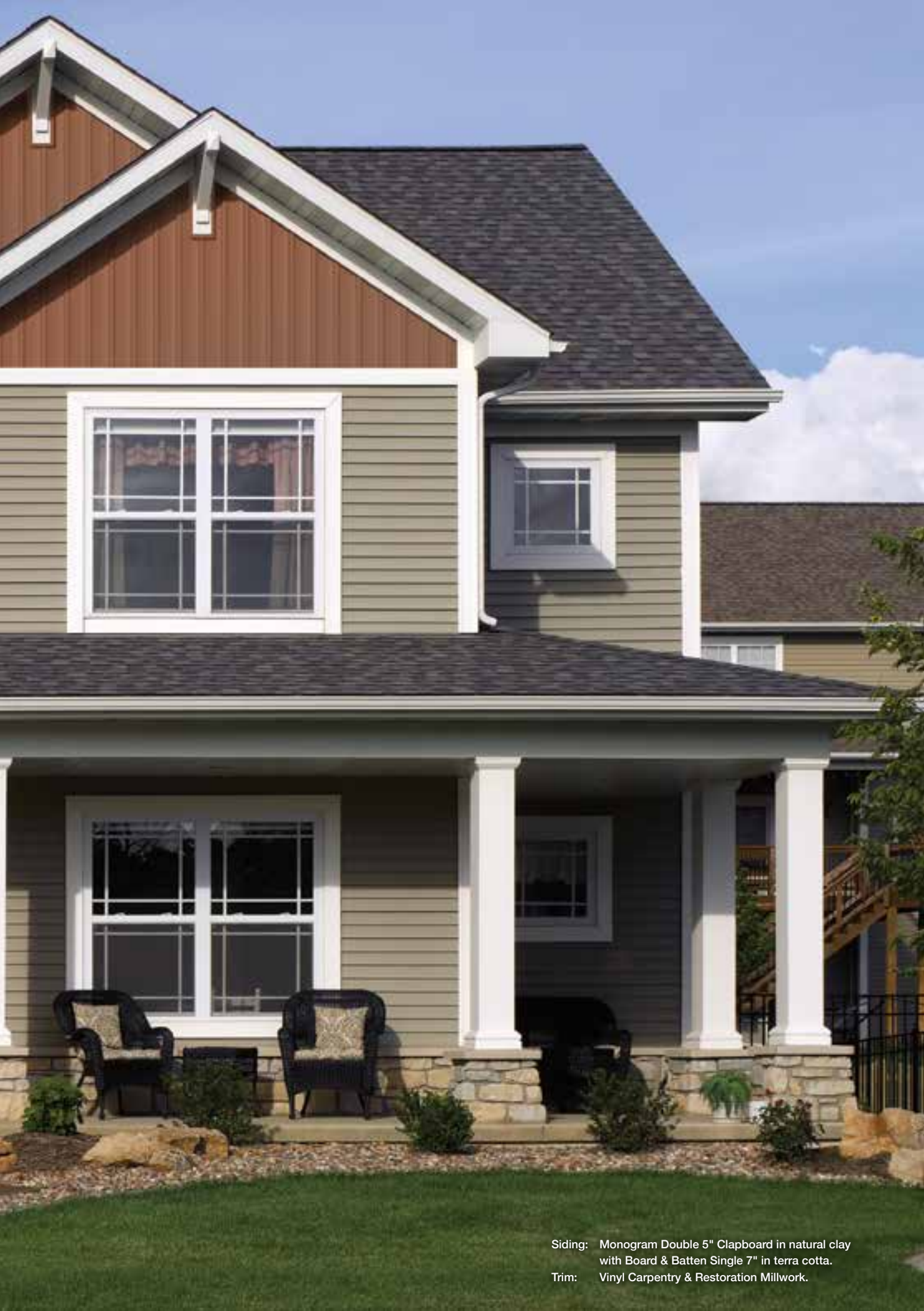
Siding: Monogram Double 5" Clapboard in natural clay with Board & Batten Single 7" in terra cotta. Trim: Vinyl Carpentry & Restoration Millwork.