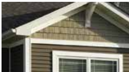
VINYL CARPENTRY ® TRIM