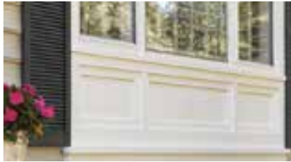
PVC EXTERIOR TRIM & BEADBOARD