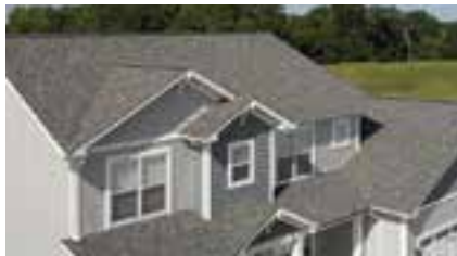
ROOFING AND VENTILATION